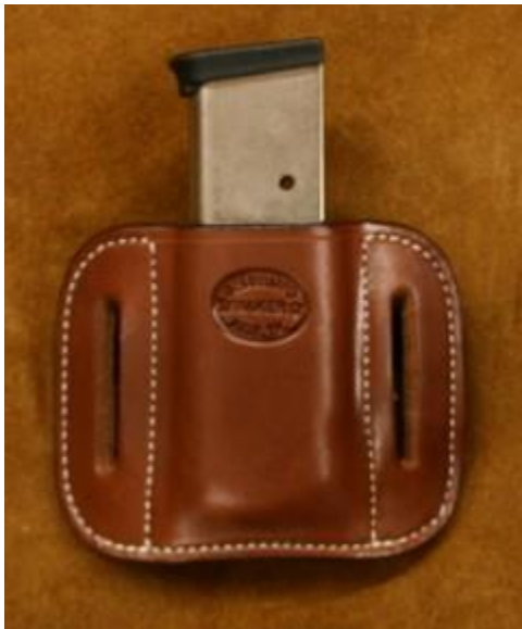
Single High Ride Mag Holder

Please note: The holster is about 6 1/2" wide and only fits cargo type pockets and is only made for small autos IE: LCP, Sig P238, Kel-Tec P3AT etc.