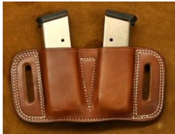
Double High Ride Mag Holder